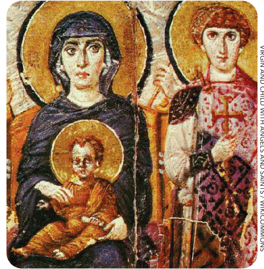
VIRGIN AND CHILD WITH ANGELS AND SAINTS

The first Christians did call Mary the “Mother of Jesus.” The title “Mother of God” wasn’t formally defined in the Church’s history until the First Council of Ephesus in 431. Around the year 250, the hymn Sub Tuum Presidium (“We Fly to Thy Patronage”) appeared, which refers to Mary as the Mother of God. Why did it take so long for the early Church to decide how to refer to Jesus’ Mother? What we call Mary is tied to how we understand Jesus’ identity as the fully human and fully divine Son of God. The Church understood Jesus as a person of the Trinity, the Son of God, who uniquely possesses both fully human and fully divine natures. In a nutshell, you can’t separate the “man” Jesus from the “God” Jesus. In clarifying what it meant to say that Jesus is the Son of God, equally one with the Father and the Holy Spirit and yet fully human and “like us in all things but sin,” the Church had to answer the question of how Mary fit into the work of salvation. Mary was the Mother of the Son of God; she was not only the Mother of Jesus’ human nature. When Catholics call Mary the “Mother of God,” they state their belief that Jesus is a single person—the Son of God—and that Mary is his Mother. ●